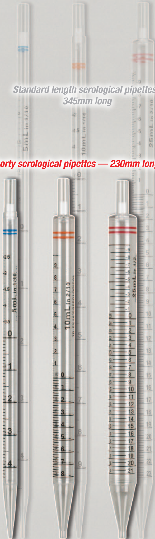
Shorty serological pipettes — 230mm long